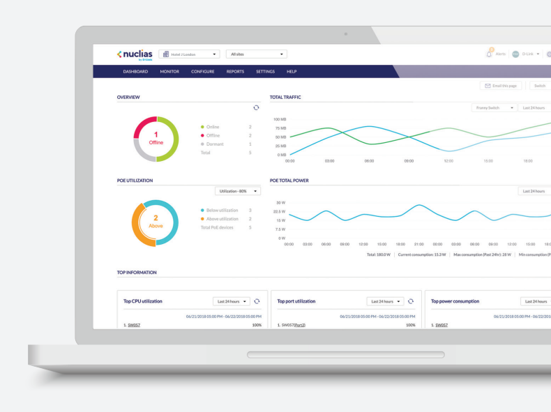
Statistics - Network Analytics