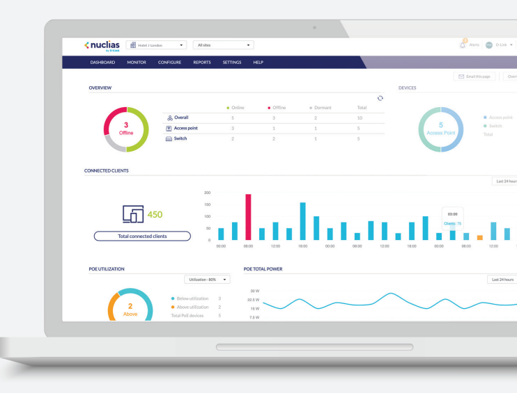
▲ Intuitive Dashboard Interface

Nuclias Cloud is D-Link's complete, cloud-managed networking solution. It allows organizations with any level of IT resources the convenience of simple network deployment and configuration. Management and monitoring is as easy as ever. Troubleshooting is quick and painless. With Nuclias Cloud, scaling is accessible and can be done on an ad hoc basis. It's professional-grade networking, without the need for networking professionals.