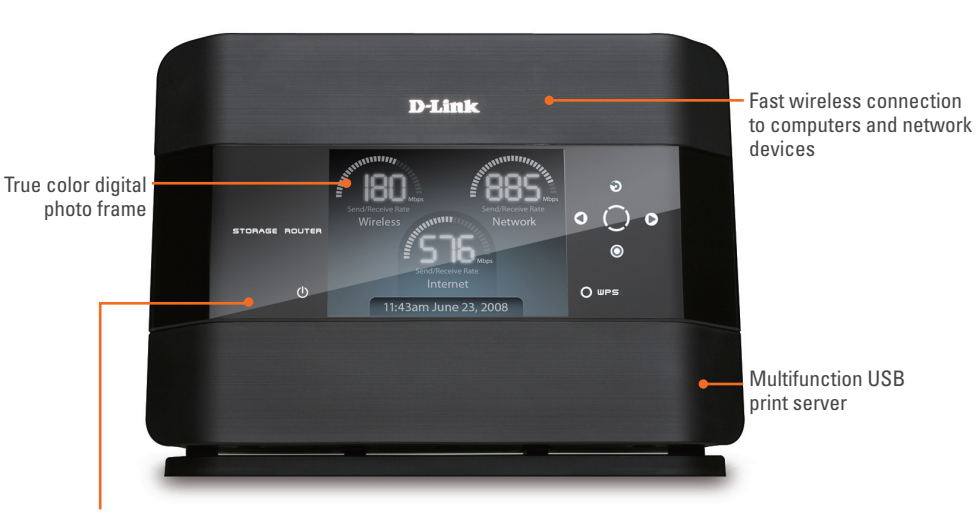
Up to 500GB of central network storage disk space with UPnP AV and FTP server support ^{3}

The DIR-685 Xtreme N<sup>™</sup> Storage Router offers a whole host of functions from one single compact box – including an Internet router, a high-speed wireless access point, network attached storage (NAS), a digital photo frame and a USB print server.