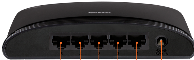
5 RJ-45 10/100 BASE-TX PORTS Connects to computers, print servers, or network storage