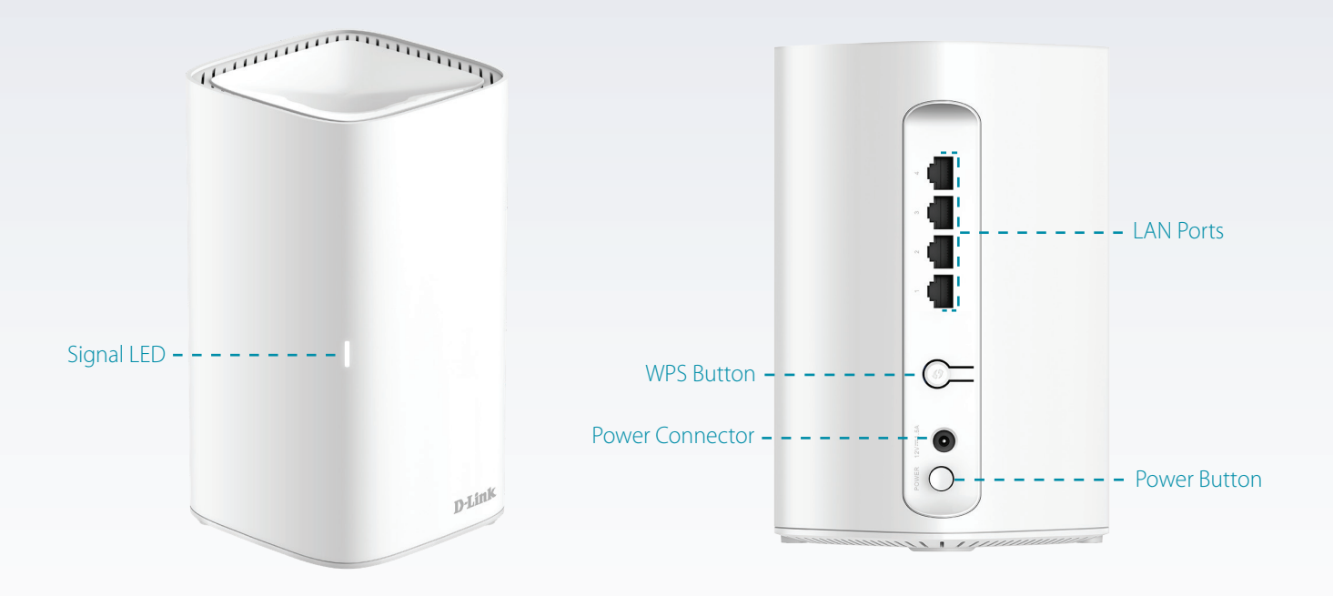
Extend Your Wireless Network using Wi-Fi