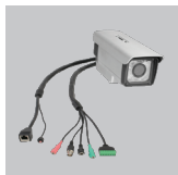
DCS-7510 Day & Night Outdoor PoE Network Camera

If any of the items are missing, please contact your reseller.