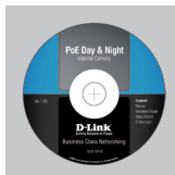
User Manual and Software on CD