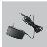
AC Power Adapter 12V 1.25A