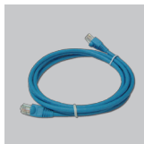
CAT5 Ethernet Cable