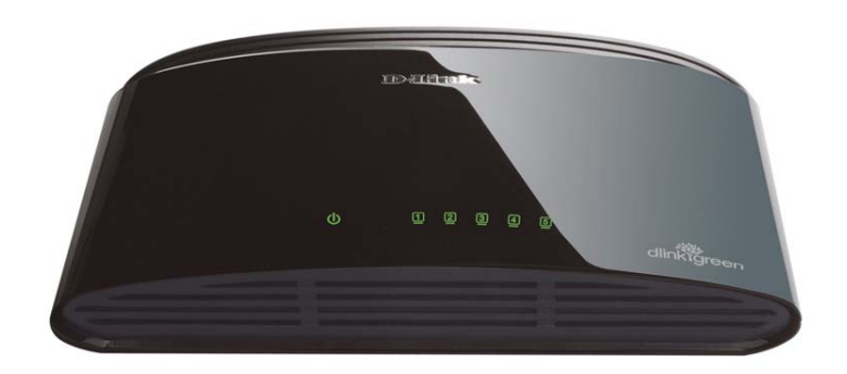
DES-1005D 10/100Mbps Fast Ethernet Switch

The figure below shows the front panel of the DES-1005D.