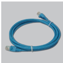
Ethernet (CAT5 UTP) Cable