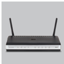
DIR-615 WIRELESS N ROUTER

If any of the items are missing, please contact your reseller.