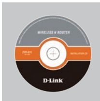
CD-ROM (Quick Router Setup Wizard, Manual and Warranty)